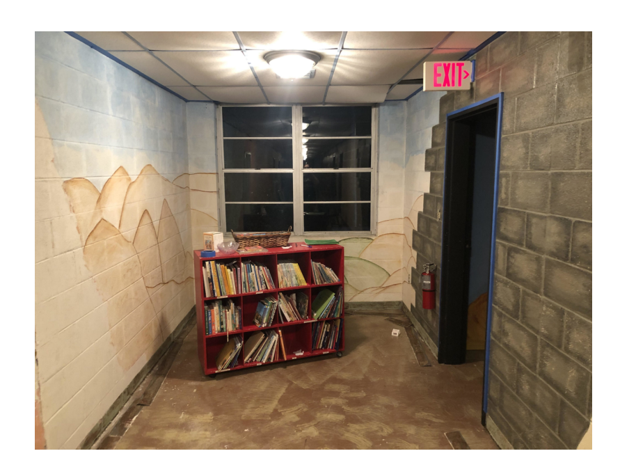
Jacksonville First UMC Before

They never have time during normal ministry seasons to freshen up an entrance hallway or go through old material that has been "stored" in what was once a viable classroom. It may take time, but eventually, we will all be together again. Why not use this time to clean and redesign? Use it as a promotion when you get to open the Children's Ministry programming again! Here are five helpful suggestions: