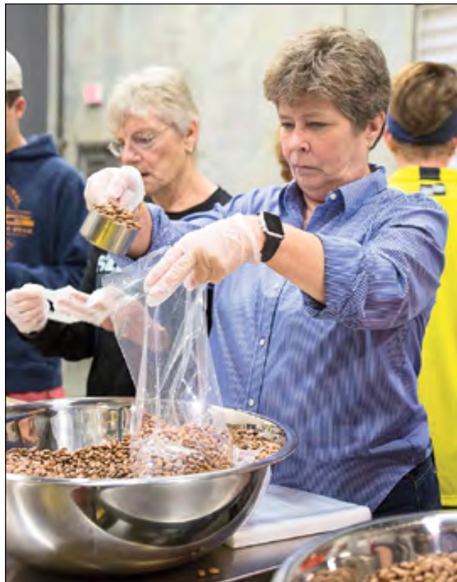
Ingathering volunteers sort and repackage pinto beans and sweet potatoes.