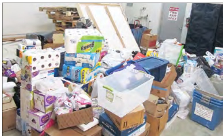
People of all ages can renew their spirit by donating items during Lent.