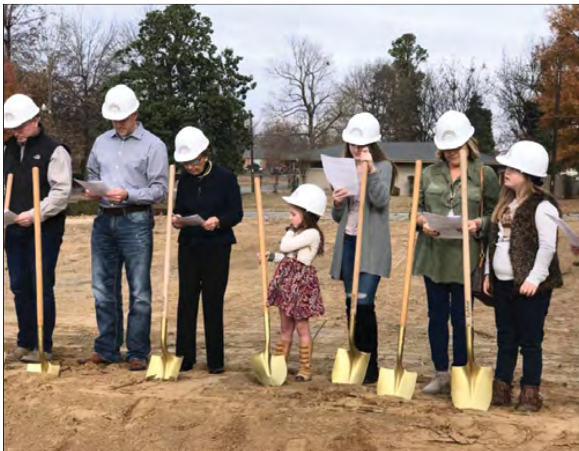
Members of Paragould First UMC turn the first spades of dirt as construction on a new addition to the church begins.