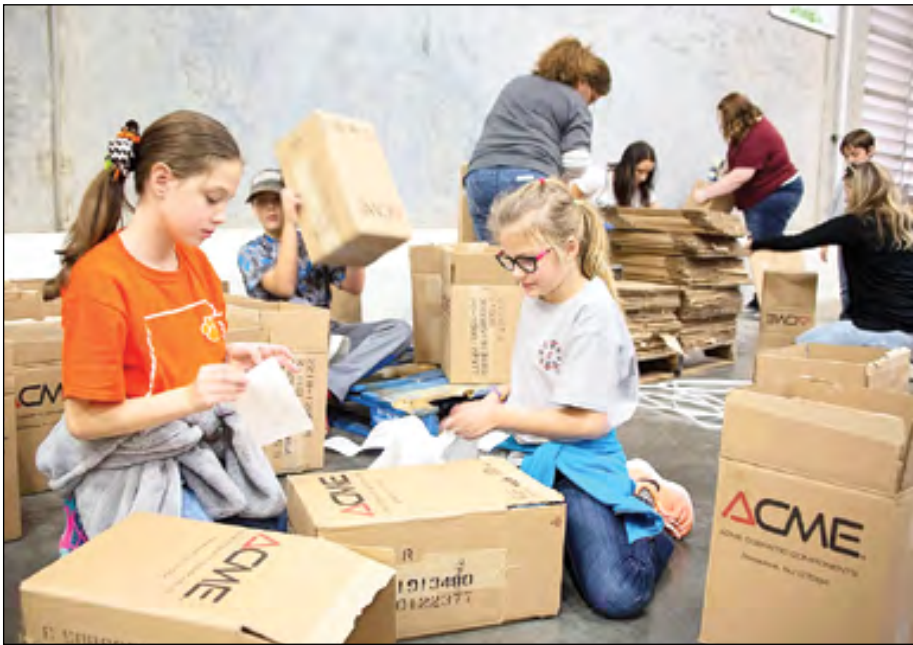
ABOVE: Youth help by labeling boxes at Ingathering. RIGHT: A team of volunteers works to organize more than 30,000 pounds of sweet potatoes for distribution.