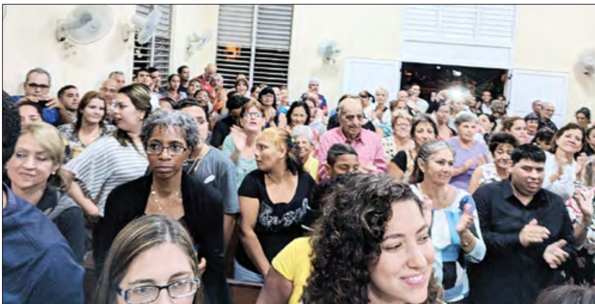
People stand in the churchyard and peer through doors and windows during a service at the Methodist Church in Santiago de la Vega, Cuba.

I would take every member of my congregation to Cuba if that were possible. The Holy Spirit is at work there, and the way that the people are responding to the Spirit's presence has much to teach us. Who knows? Perhaps revival will break out in our own country next.