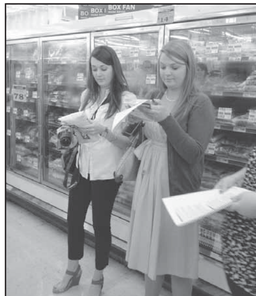
Participants in the central Arkansas training session for Shopping Matters learn about unit pricing, which will help them maximize grocery dollars for nutritious, lower cost foods.

Kids who participated in the first Cooking Matters class at the Arkansas Foodbank make healthy mini-pizzas during their graduation night session.