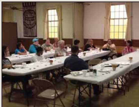
St. Luke UMC Little Rock on May 18 hosted a training session led by Justice for Our Neighbors as part of the preparation process for opening a legal aid clinic.