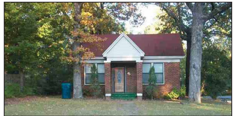
This home across the street from Oak Forest UMC is being transformed into Barnabas House, a counseling and social-work center to serve uninsured and otherwise vulnerable residents of the community.