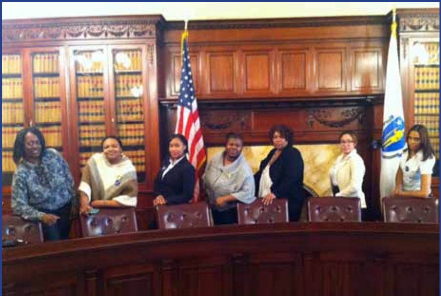
Photo of advocates at the State House in Boston, MA