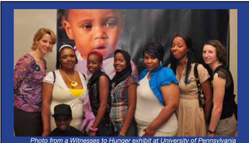
Photo from a Witnesses to Hunger exhibit at University of Pennsylvania

Community advisory boards, organizing committees, or any other group of local community members, are important for guiding the work of your organization and inspiring change. In the same way that a nonprofit is accountable to its board of directors and funders, it is essential to be held accountable by the people you serve. By coming together to speak out on an injustice, community members can take a leadership role and both teach and learn from others. By including every voice, we can better understand an issue and discover solutions.