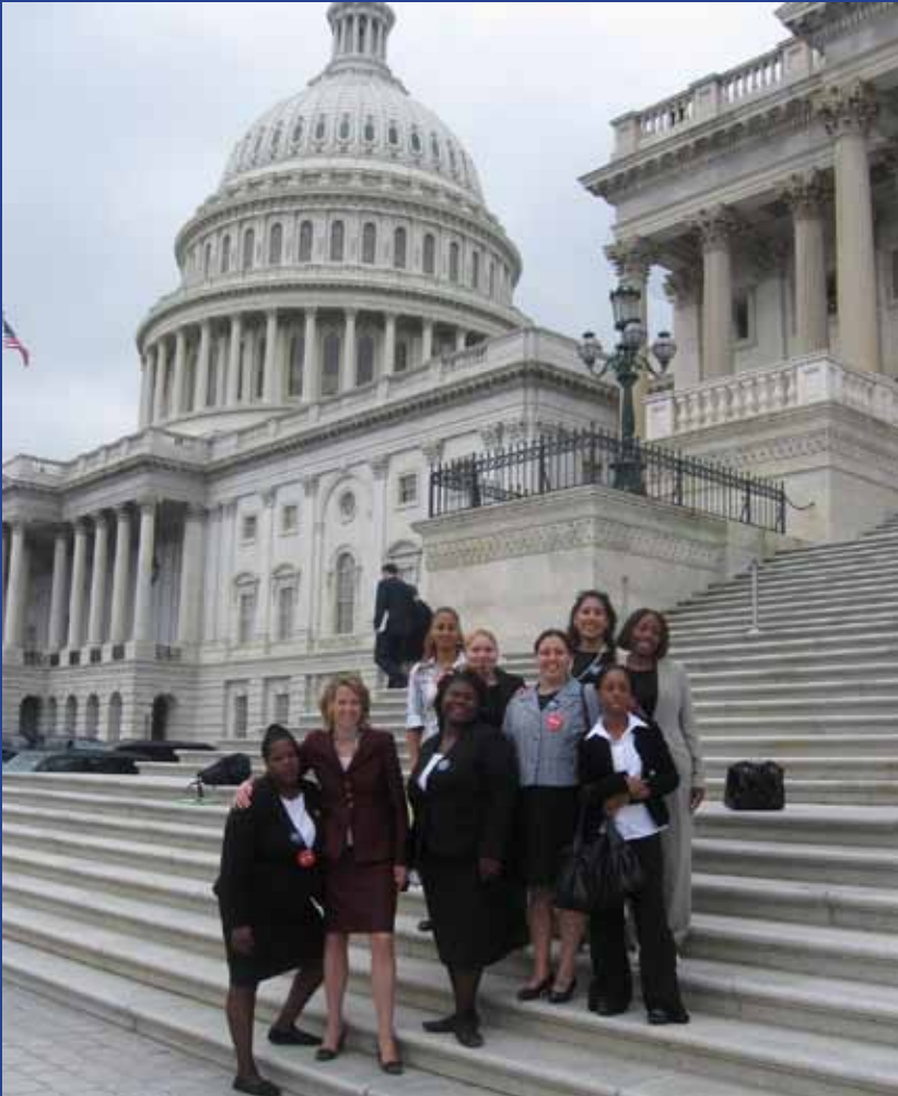
Photo of Witnesses to Hunger at the U.S. Capitol

We hope that you will seek out ways to build partnerships with others in the community. We encourage you to go out and make your own unique mark in this work and to find solutions to poverty and hunger. If you are interested in creating your own chapter of Witnesses to Hunger, please contact us at info@witnessestohunger.org , and we will work with you to build your project.